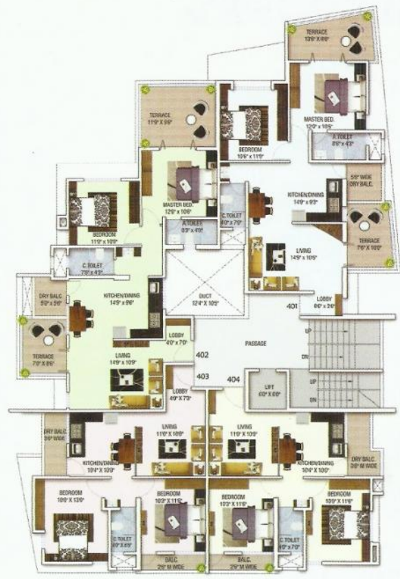
FOURTH FLOOR PLAN ▲