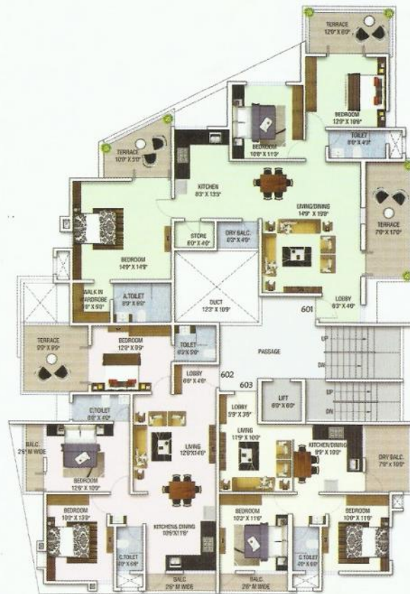
SIXTH FLOOR PLAN ▲