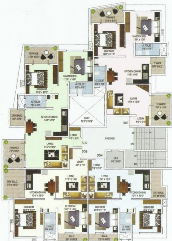
FIFTH FLOOR PLAN ▲