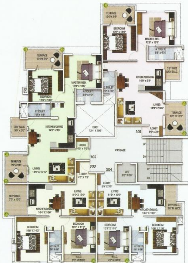
THIRD FLOOR PLAN ▲