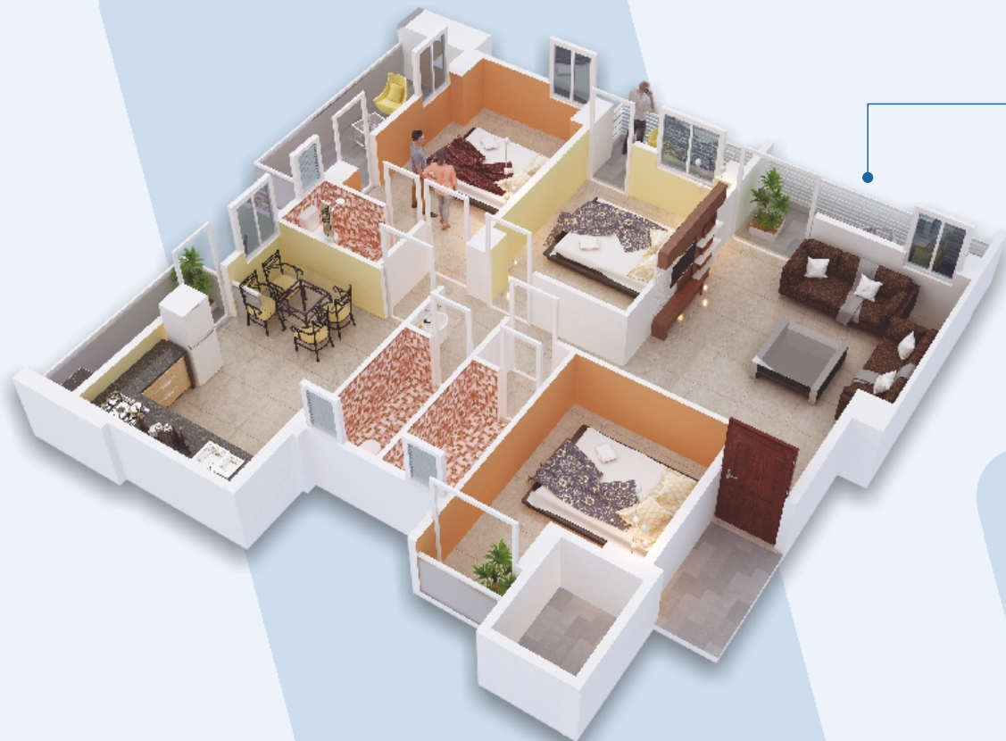
(101) 3 BHK