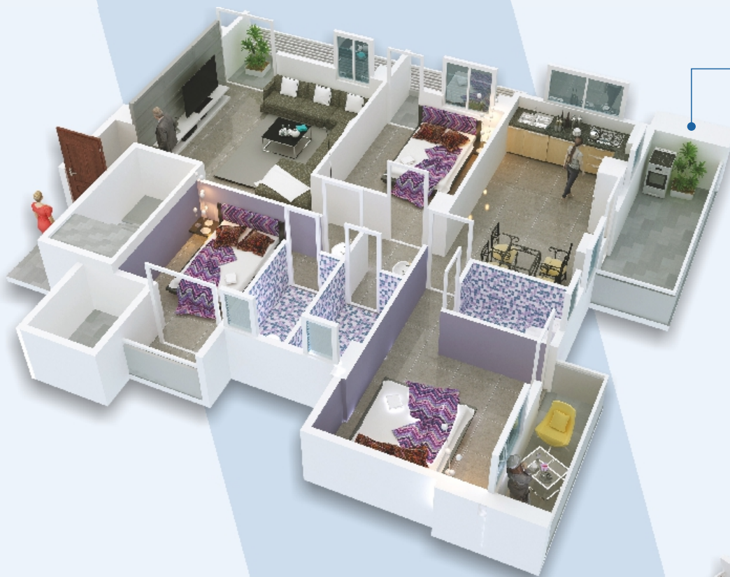
(102) 3 BHK