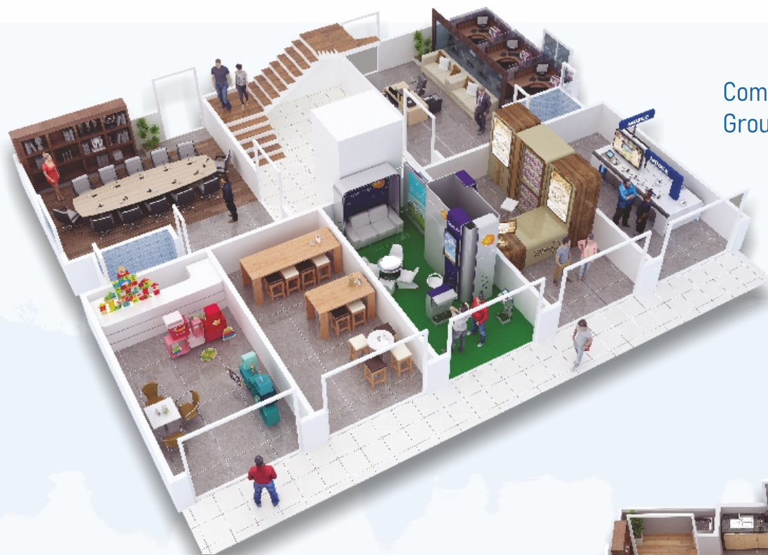
Commercial Ground Floor