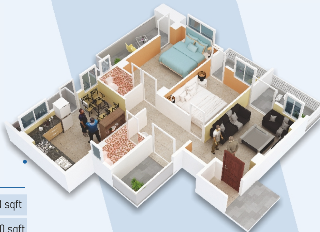
(103) 2 BHK