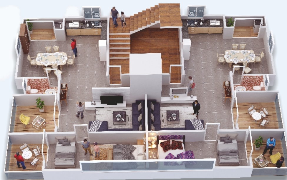
Commercial First & Second Floor