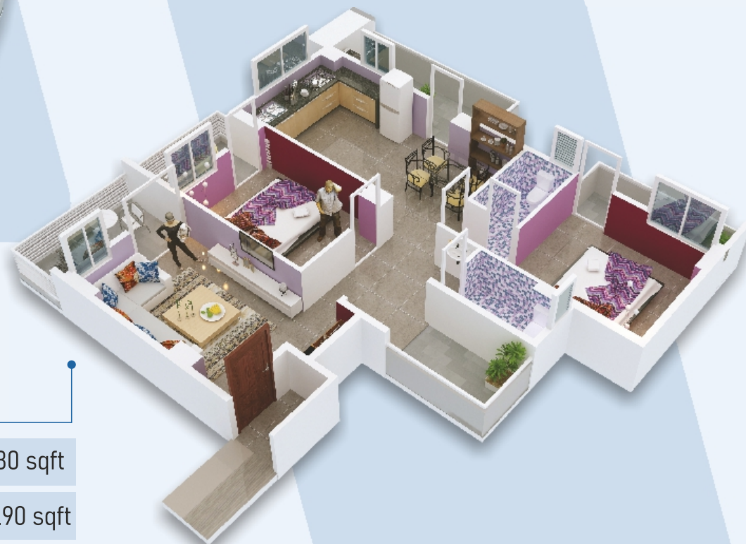
(104) 2 BHK