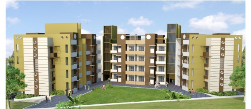
VINAYAK ENCLAVE - K. P. CORNER, MAZGAON ROAD, NEW HIGHWAY, RATNAGIRI.