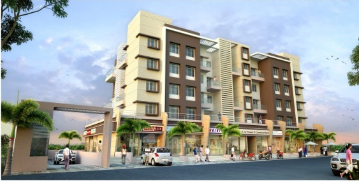
KSP COMPLEX - K. P. CORNER, MAZGAON ROAD, NEW HIGHWAY, RATNAGIRI.

रत्नागिरीतील मध्यवर्ती ठिकाण म्हटलं की, समोर येते ते मारुती मंदिर आणि याच मारुती मंदिराच्या जवळपास अंतरावरच साकारत आहेत के.एस.पी. बिल्डर्स अँड डेव्हलपर्स यांचे महत्वाकांक्षी गृहप्रकल्प