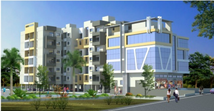
AJINKYATAR RESIDENCY - K. P. CORNER, MAZGAON ROAD, NEW HIGHWAY, RATNAGIRI.