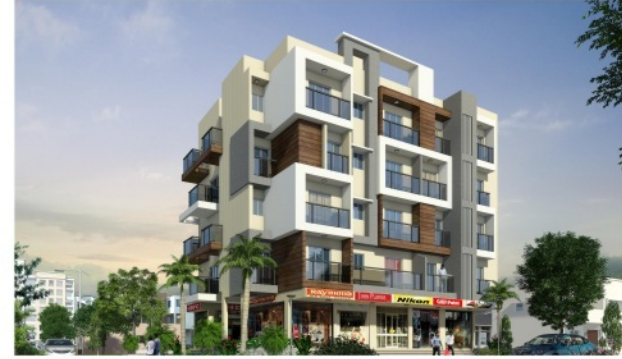
ARADHYA RESIDENCY - ABHUDAY NAGAR, RATNAGIRI