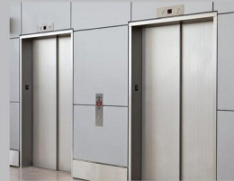
2 Lifts With 24hr Generator Backup