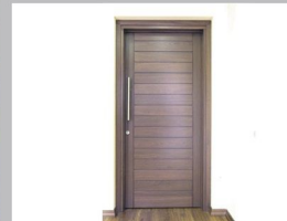
8'x4' Height Main Entrance Door