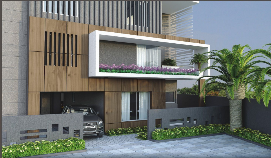
Luxurious 3 BHK Bungalow