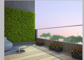
Vertical Garden, Toughened Glass Railing & Wooden Tile