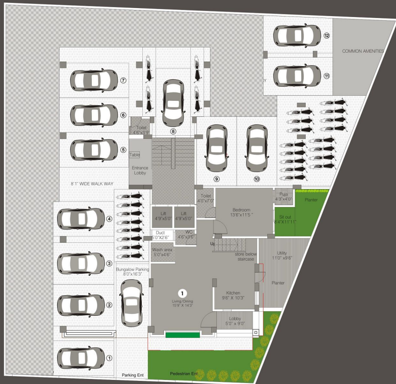
PARKING FLOOR PLAN