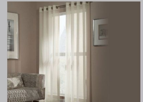
7'6" Height Anodised French Window