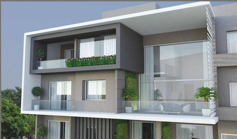
Luxurious 3 BHK Pent House

Experience a life full of Natural Bliss !