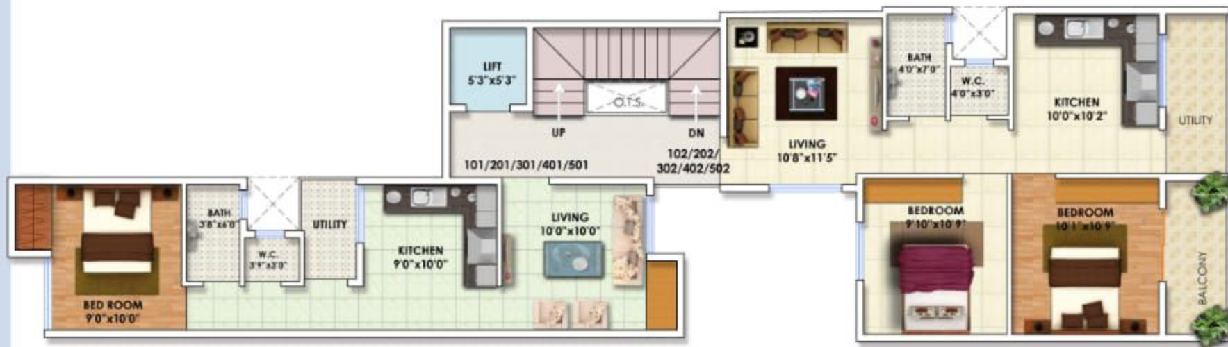
TYPICAL 1s, 2nd, 3rd, &amp; 4th FLOOR PLAN