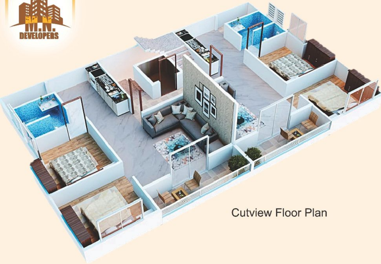
Cutview Floor Plan