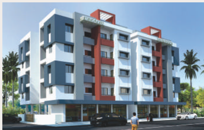
Vastu Shilp : Waluj CIDCO Mahanagar-I