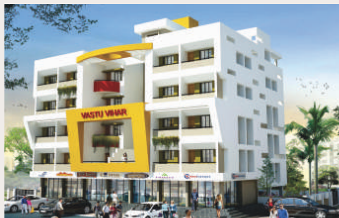
Vastu Vihar : Waluj CIDCO Mahanagar-I