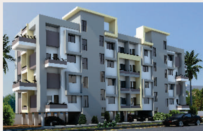
Cube Vastu : Paithan Road, Aurangabad