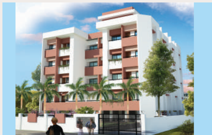
Vastu Vaibhav : Waluj CIDCO Mahanagar-I