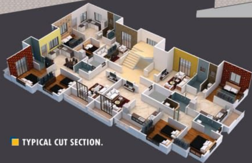
■ TYPICAL CUT SECTION.