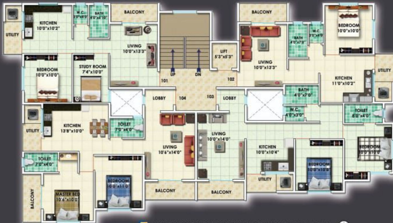
■ TYPICAL FIRST, SECOND, THIRD, FOURTH & FIFTH FLOOR