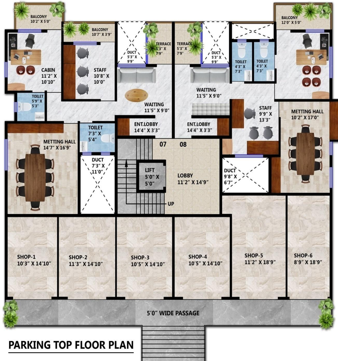
PARKING TOP FLOOR PLAN