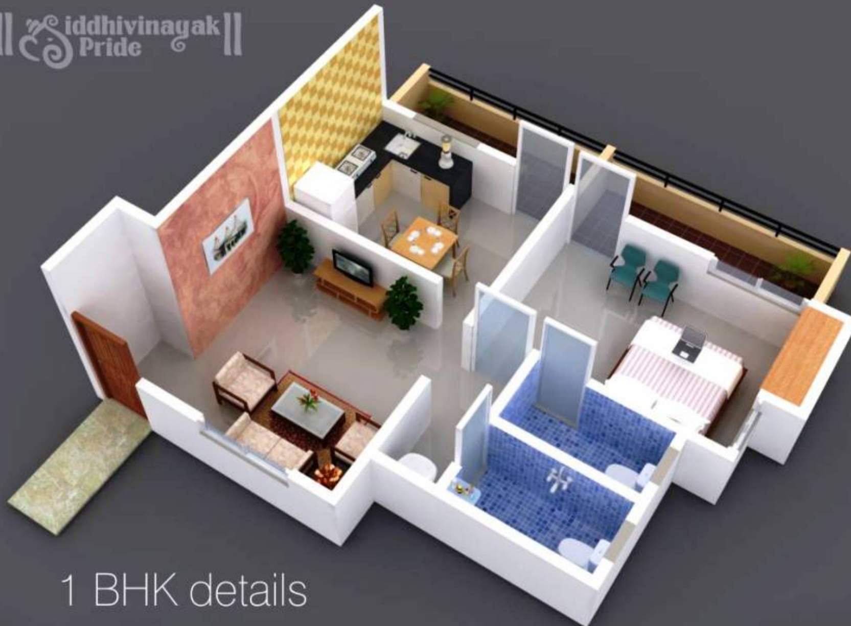
1 BHK details