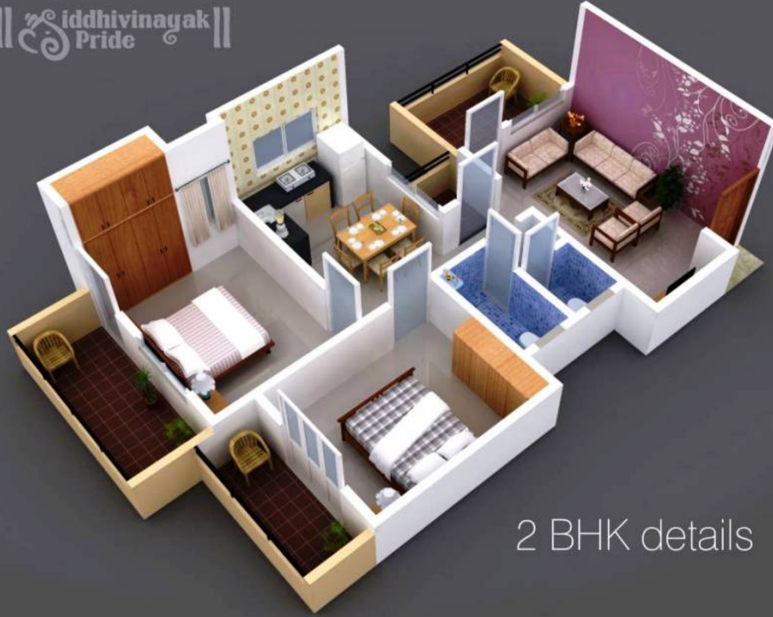
2 BHK details