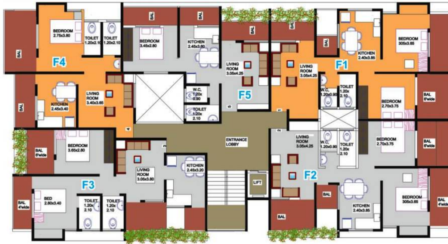
1st & 3rd - Typical Floor Plan