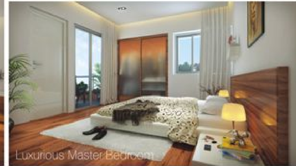
Luxurious Master Bedroom