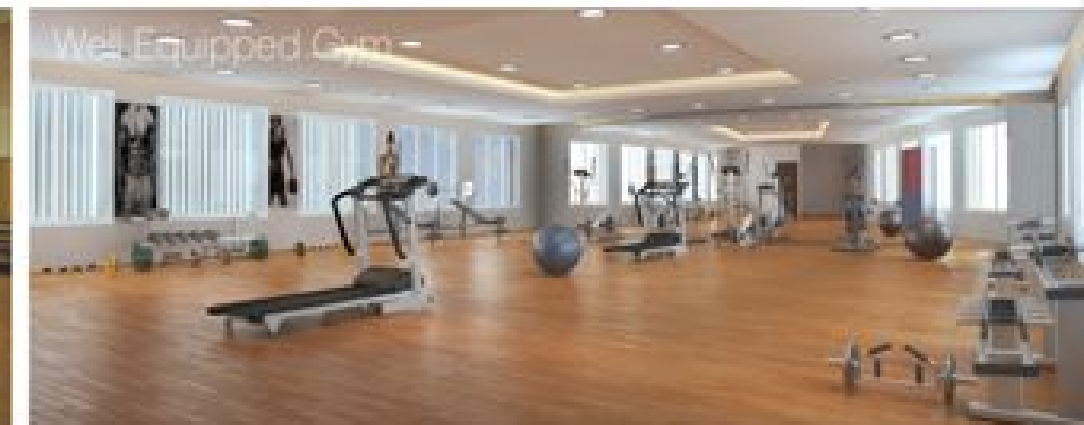
Well Equipped Gym