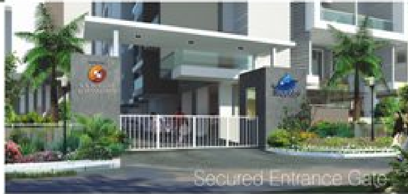
Secured Entrance Gate

Dr. D Y Patil Hospital, 100 bedded multi-specialty Apple Hospital, is within 1 km from this Location.