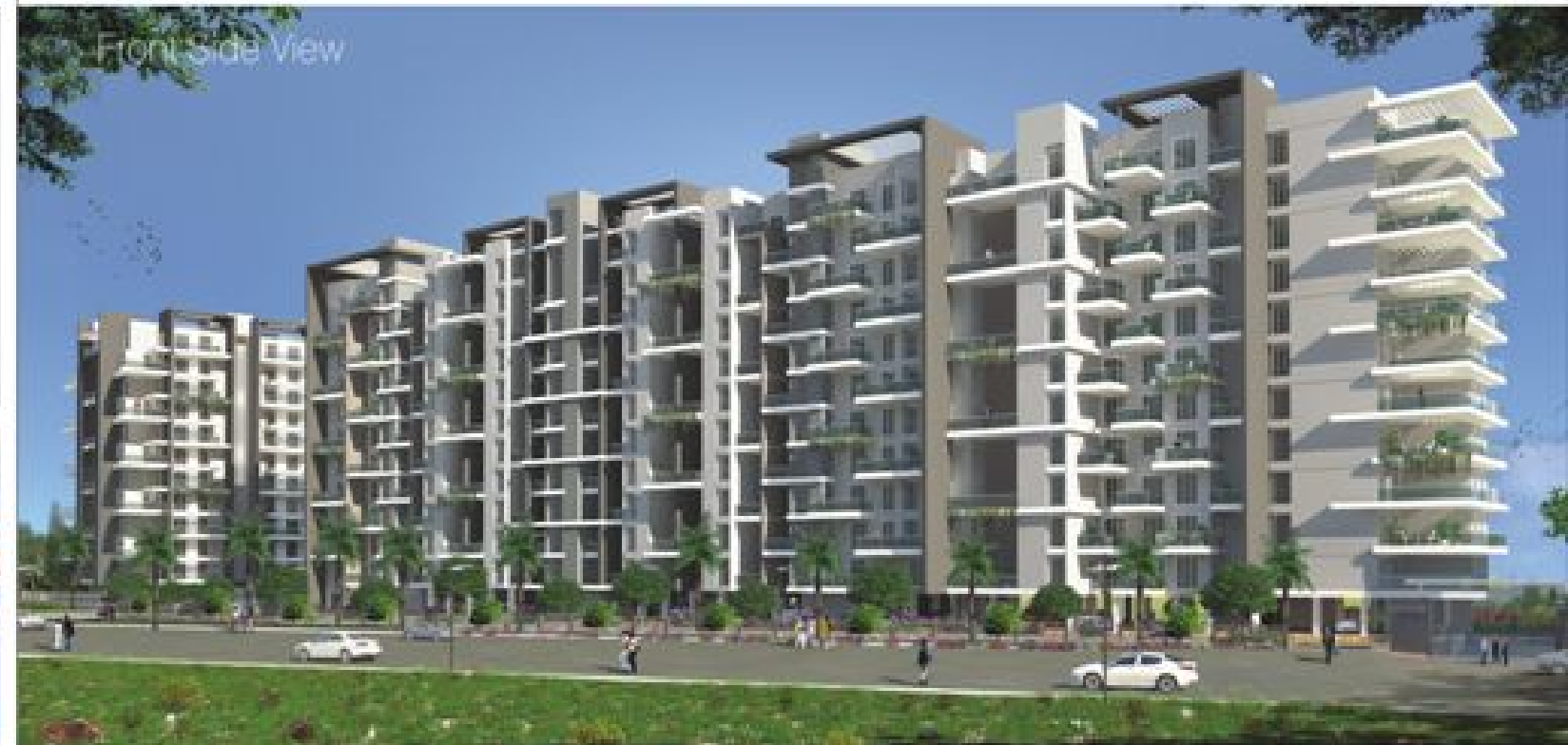
Front side view