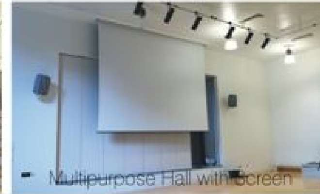
Multipurpose Hall with screen