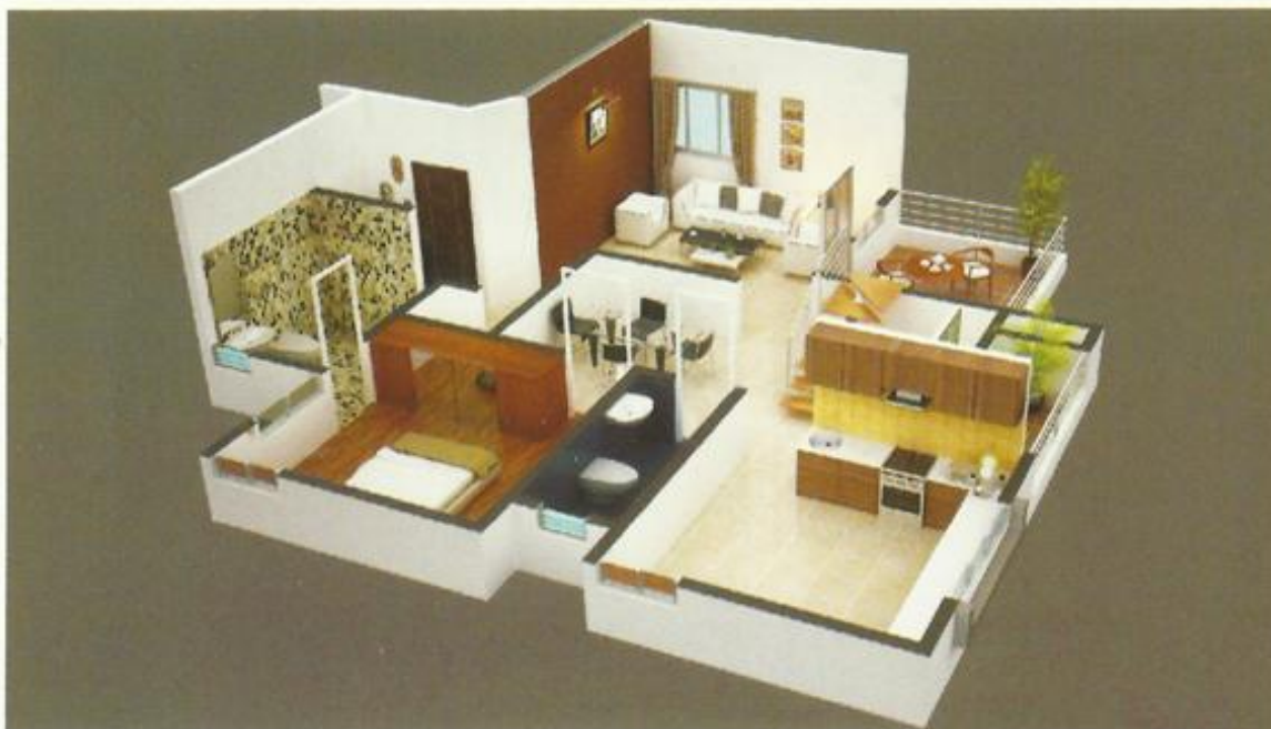
Duplex 5th Floor