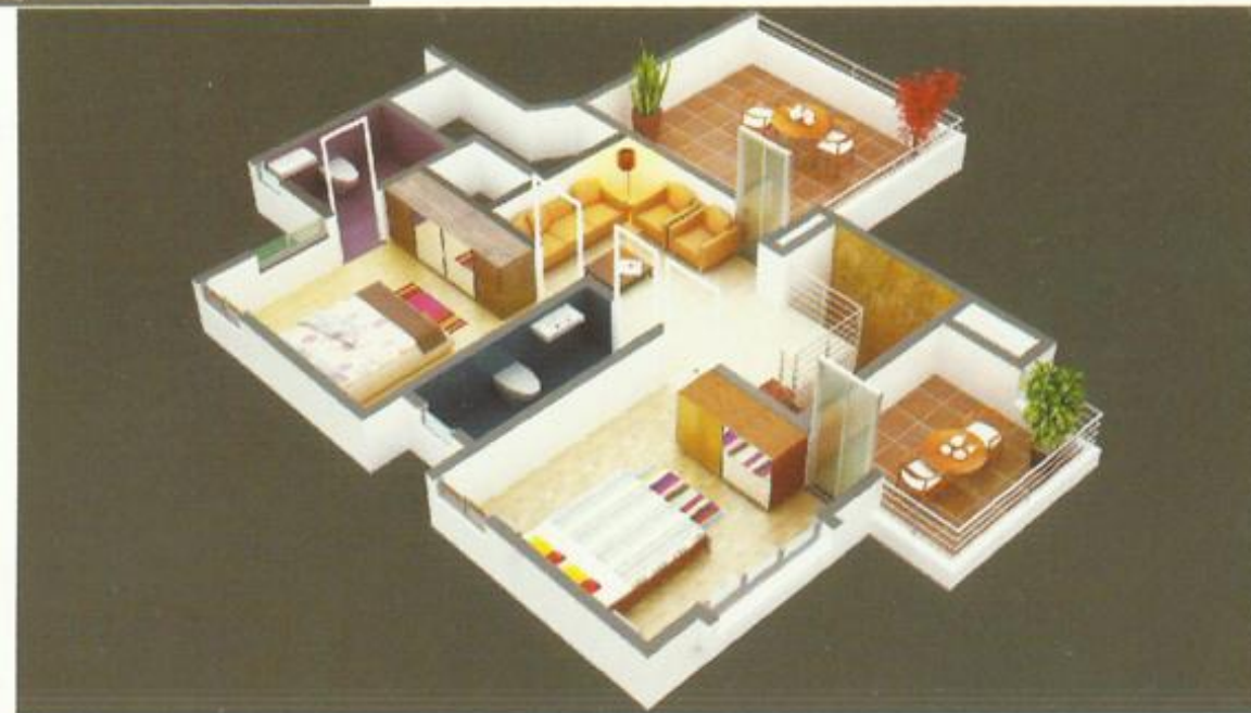
Duplex 6th Floor