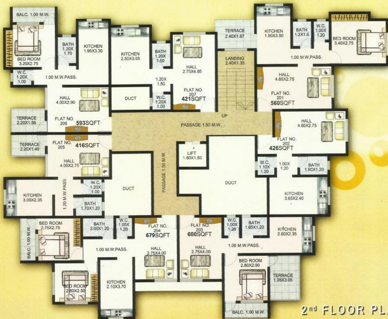
2 nd FLOOR PLAN