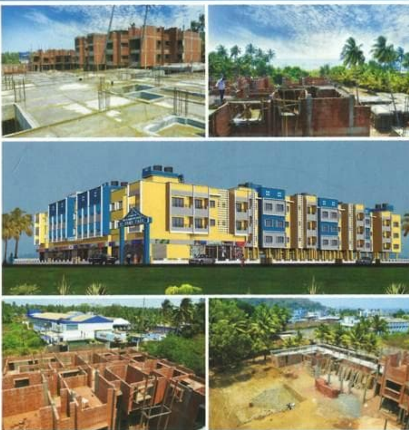
ACTUAL SITE PICTURES

Bank Loan : Scheme approved by HDFC Bank & Loans from all banks available